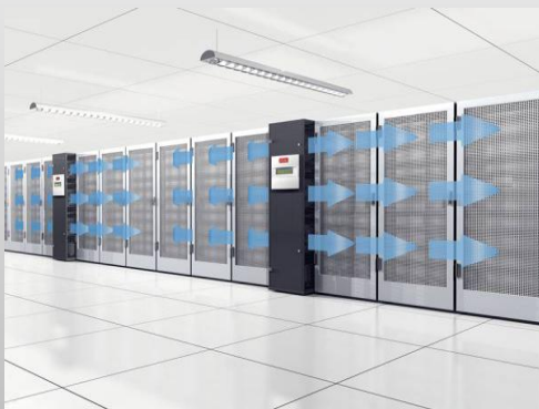
AC installed between racks