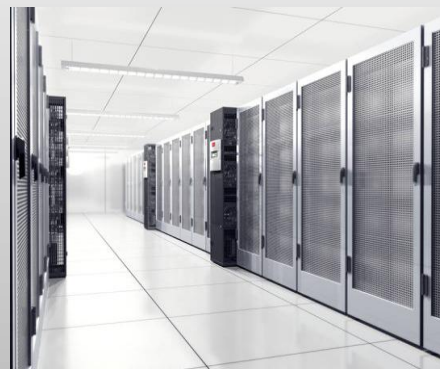
AC installed between racks (Cold aisle)